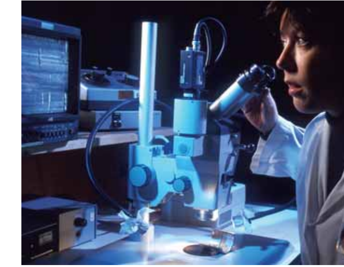
Mobil Delvac 1300 Super 15W-40 – known the world over as 'The Million Mile Oil' – thanks to a relentless commitment to research and development. The program includes millions of miles in highway fleets, along with non-stop laboratory work, testing lubricants in engines from every major manufacturer.

Mobil Delvac is widely available right across North America. In Canada you have the added peace of mind of The Ultimate Lubrication Warranty from Imperial Oil, the largest marketer of petroleum products in the country and one of Canada's most trusted names.